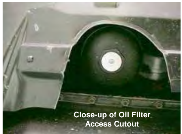
Close-up of Oil Filter Access Cutout