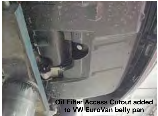
Oil Filter Access Cutout added to VW EuroVan belly pan

The directions are printed on the template. The template is printed actual size.